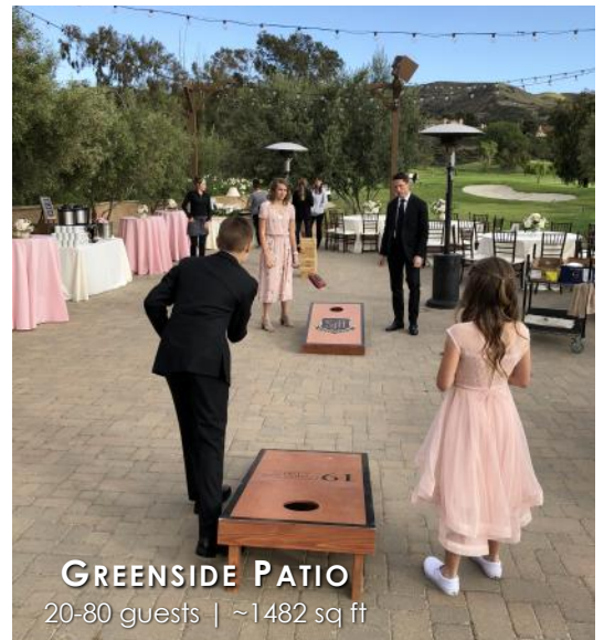
GREENSIDE PATIO 20-80 guests | ~1482 sq ft