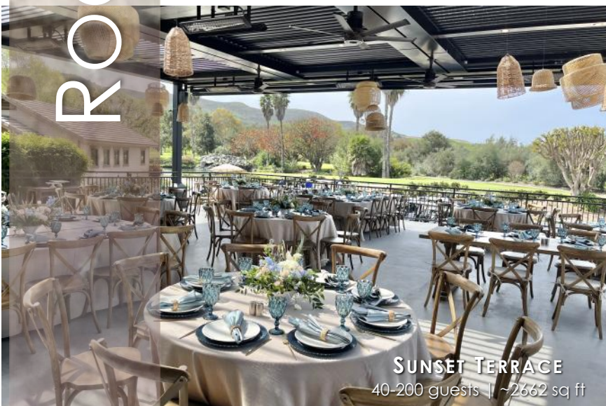
SUNSET TERRACE 40-200 guests | ~2662 sq ft