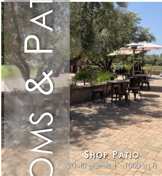
SHOP PATIO 20-40 guests | ~1000 sq ft