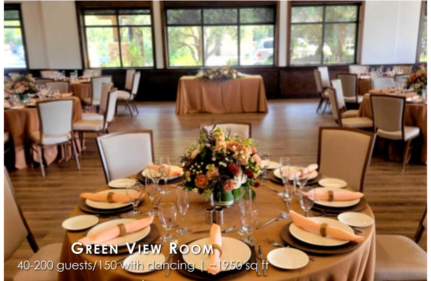
GREEN VIEW ROOM 40-200 guests/150 with dancing | ~1950 sq ft