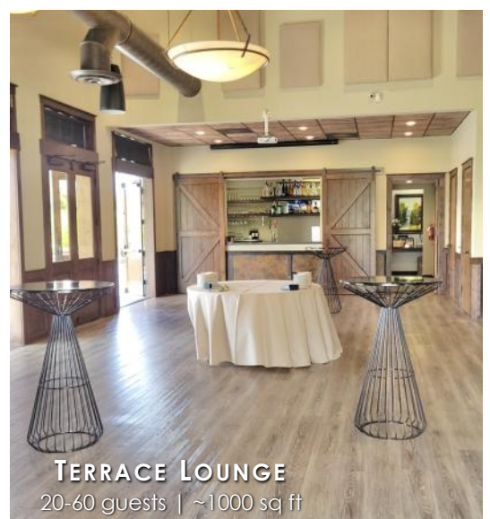
TERRACE LOUNGE 20-60 guests | ~1000 sq ft