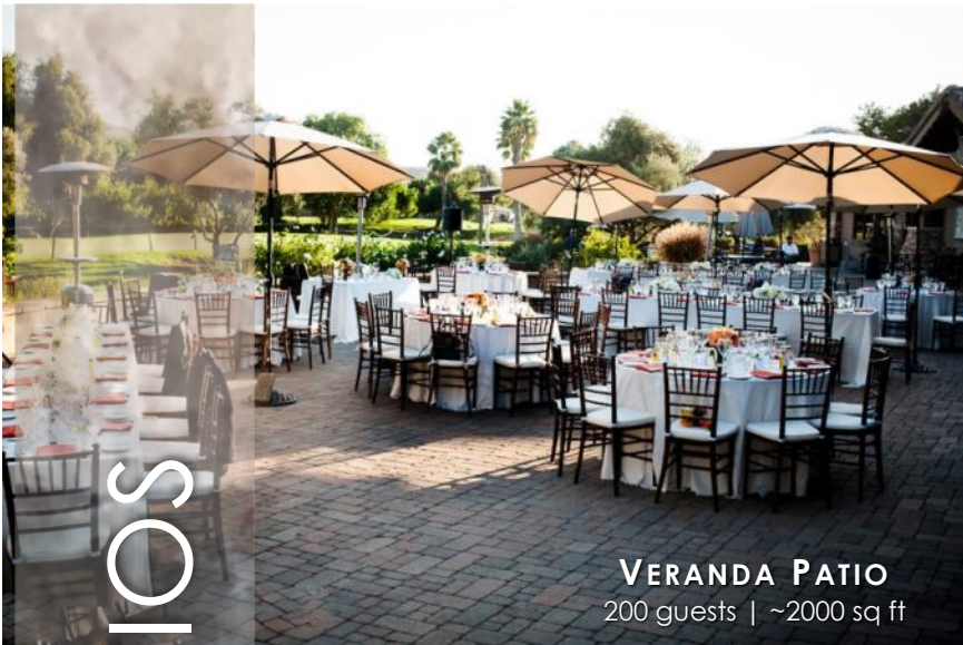
VERANDA PATIO 200 guests | ~2000 sq ft